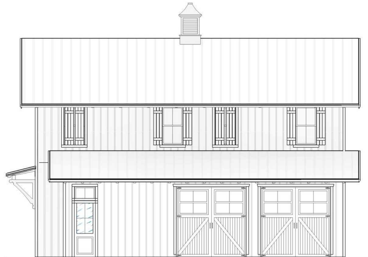
LEFT & RIGHT ELEVATION