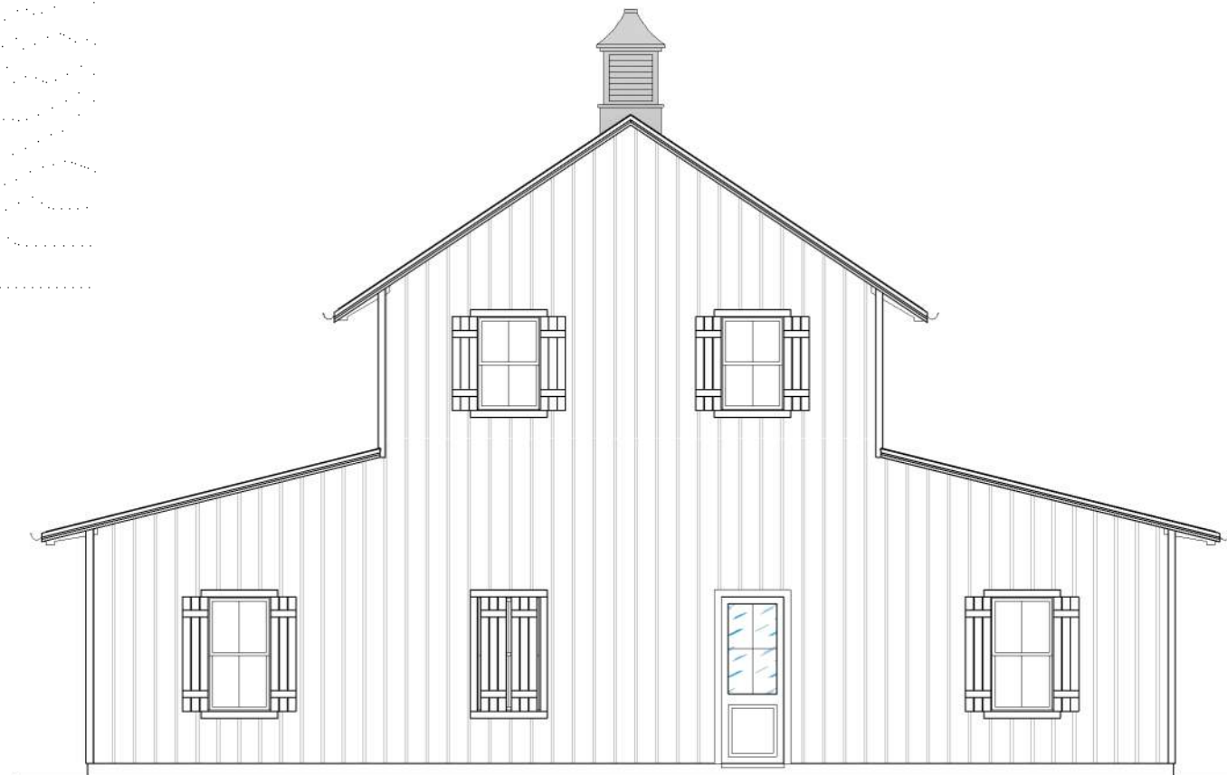
FRONT & REAR ELEVATION