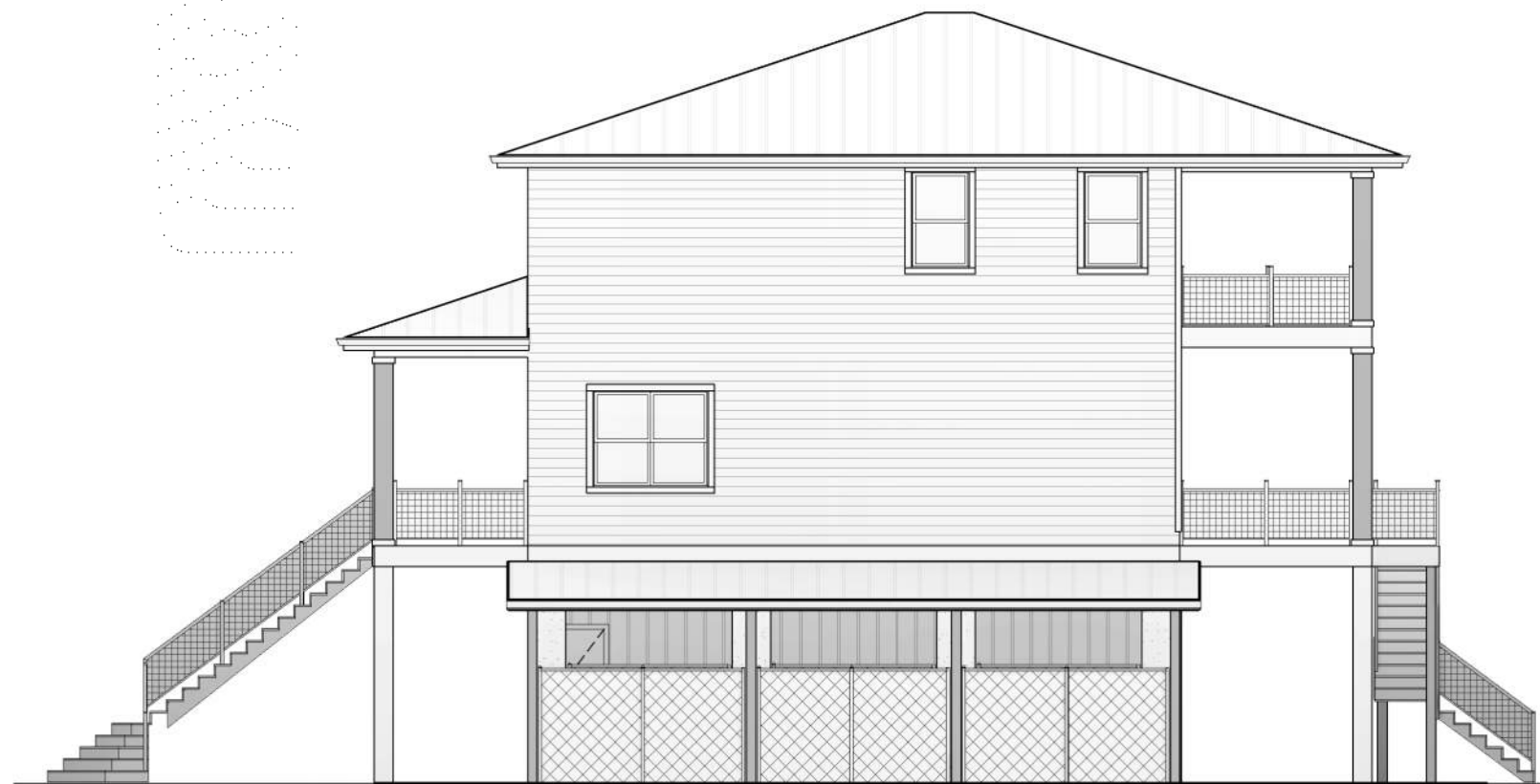
LEFT & RIGHT ELEVATION