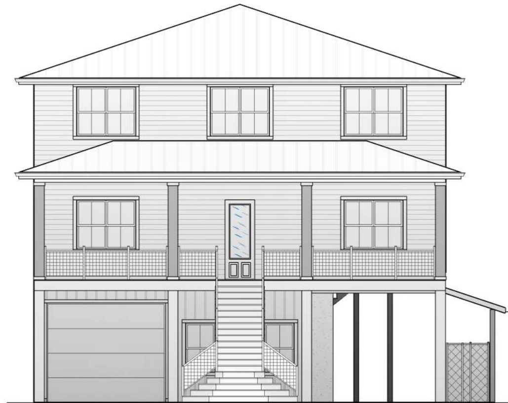
FRONT & REAR ELEVATION