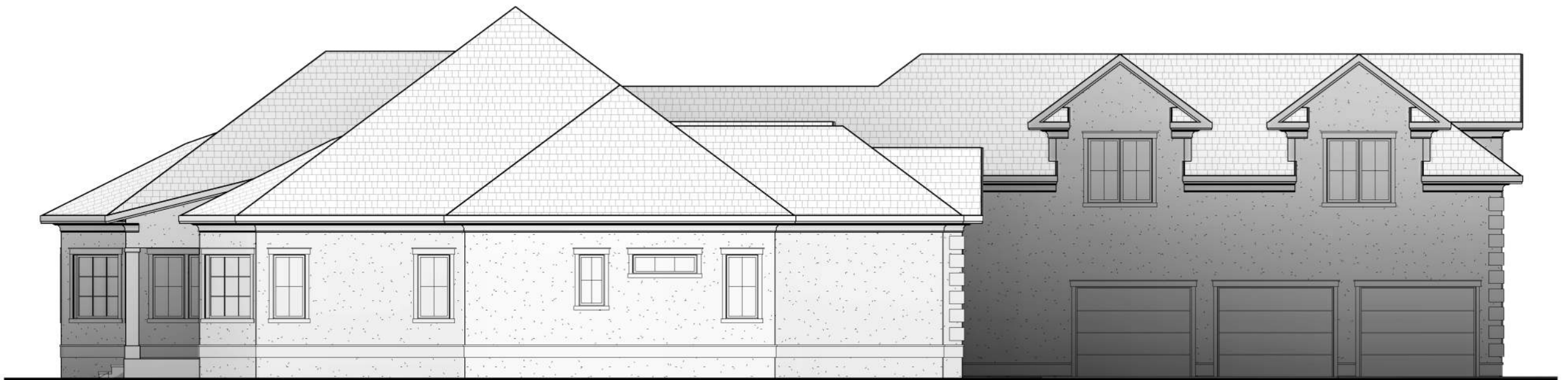
LEFT & RIGHT ELEVATION