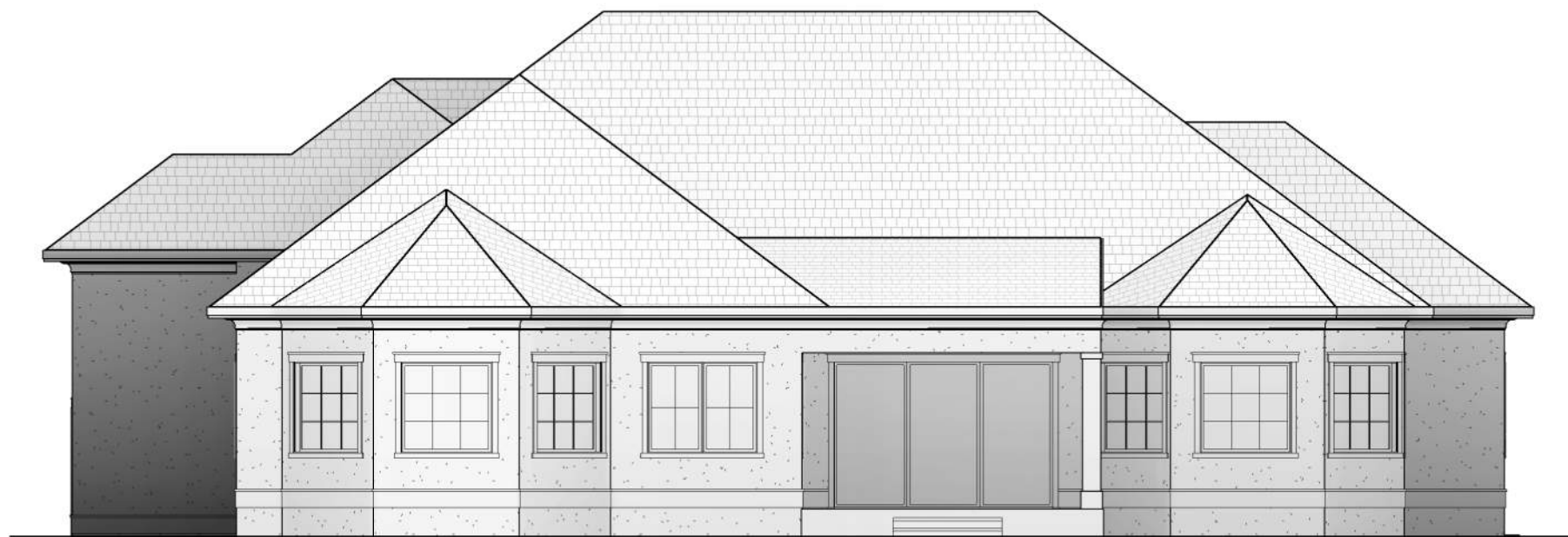
FRONT & REAR ELEVATION