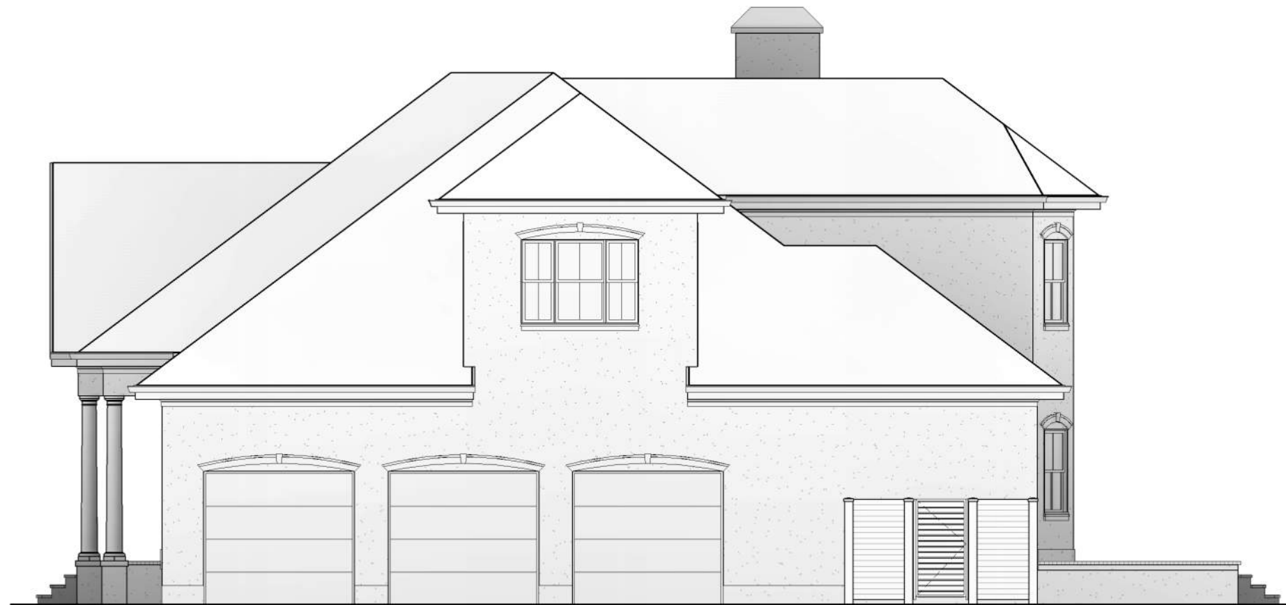
LEFT & RIGHT ELEVATION