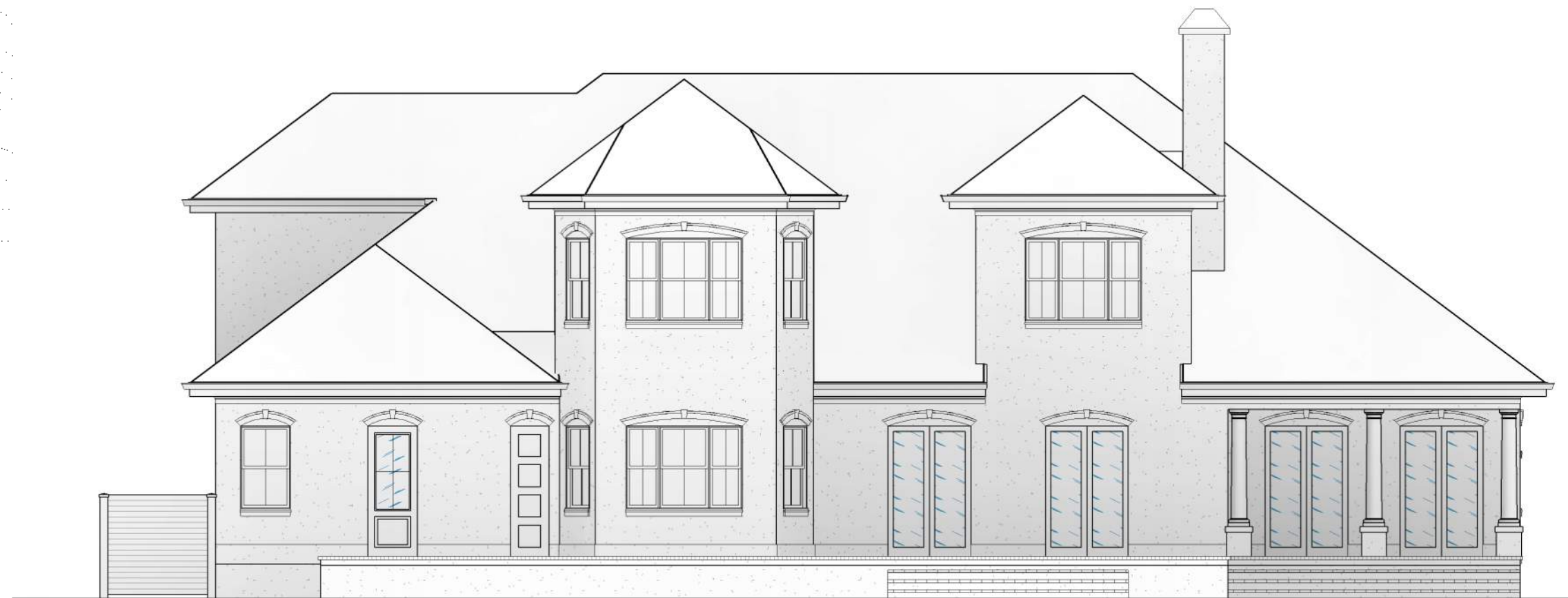
FRONT & REAR ELEVATION