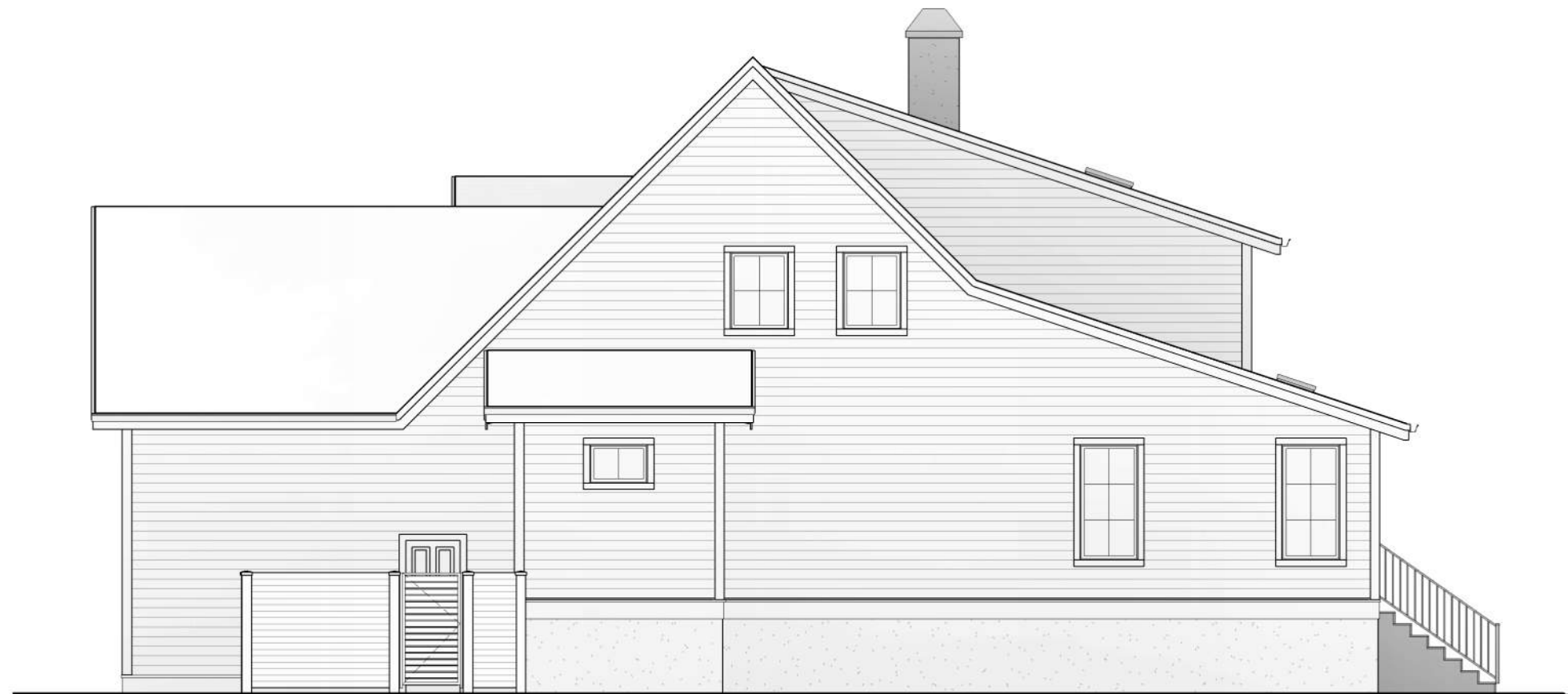
LEFT & RIGHT ELEVATION