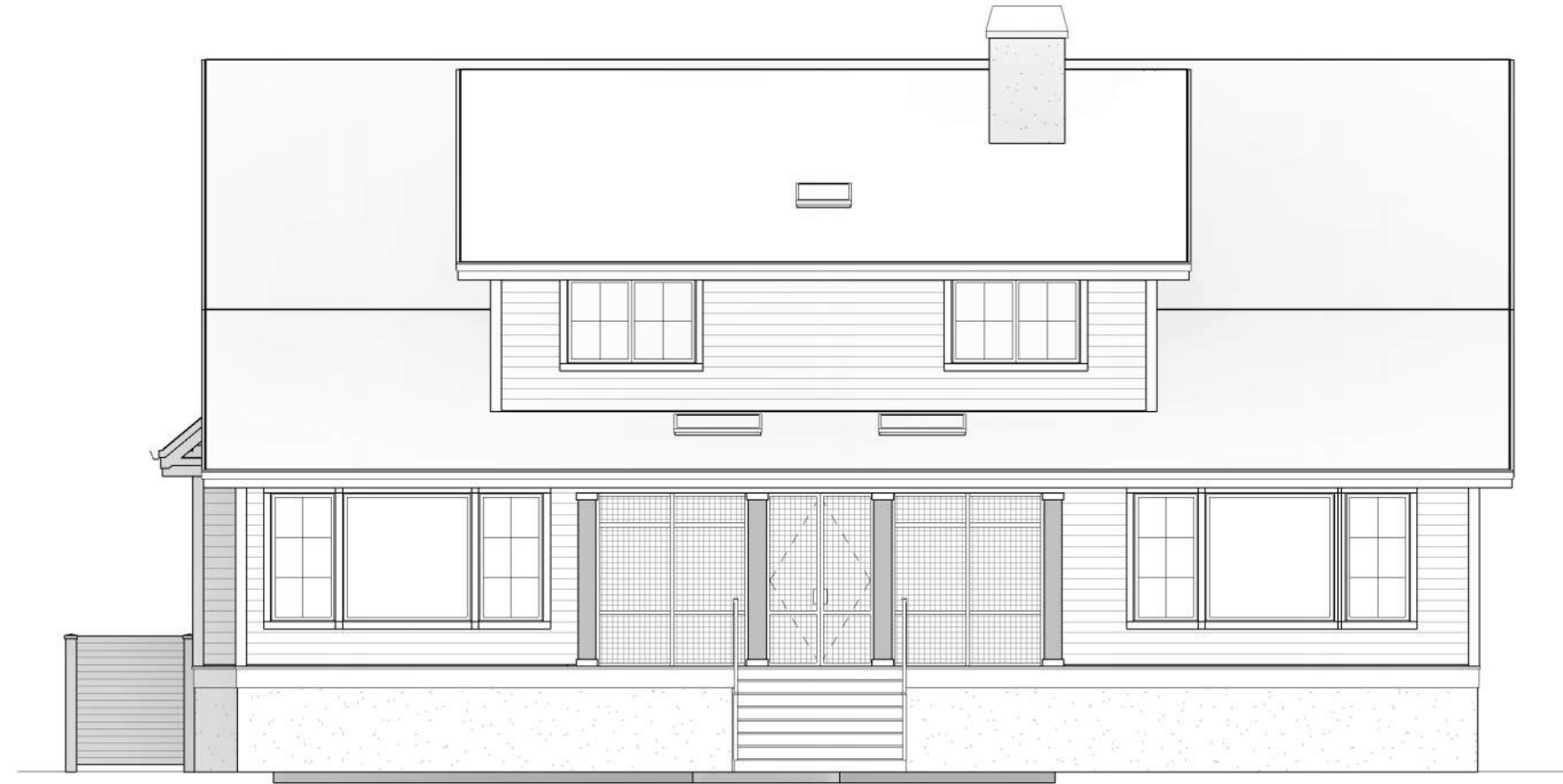
FRONT & REAR ELEVATION